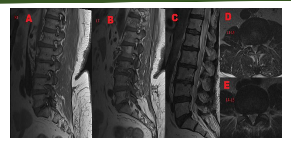
Fig 1. T2 sag sequence image "A and B" showed narrowing neural foramens due facet joint hypertrophy, image "C" with osteoarthritis signs, Schmorl nodules, and disk protrusion, the central canal is narrowed. Image "D and E" show axial projection on L3-L4 and L4-L5 disk spaces.