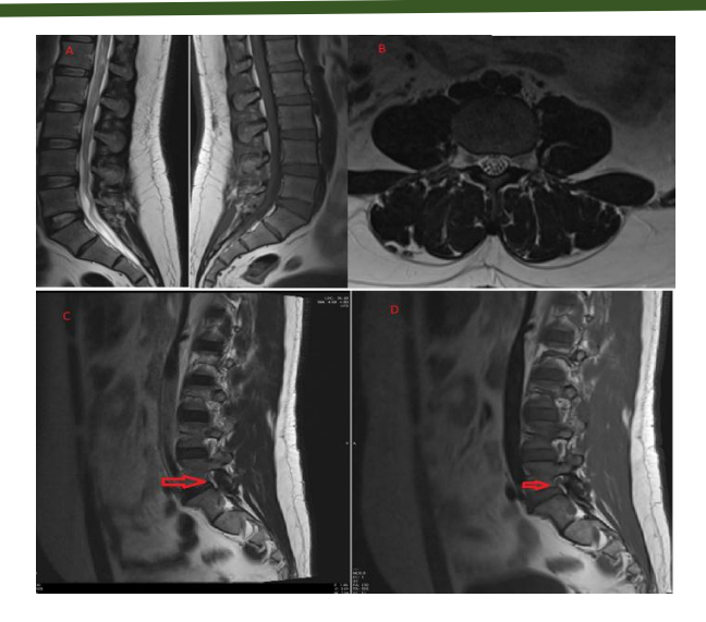
Fig. 2. MRI Lumbar spine showing narrowing of central canal and bulging disk from L1-L2 to L5-S1, no significant compression of cauda equina nerve root or isolated nerve root (Images A and B) trapped right L5 nerve root at L5-S1 foramen due facet join hypertrophy (Red arrow images C and D).

Cervical MRI noted focal protrusion in C4-C5 and C5-C6 on the right side, mainly in C5-C6 contacting the spinal cord, inverted cervical lordosis, anterior and posterior cervical osteophytes, and severe narrowing of the central canal from C5 through C6 level. (Fig 3)