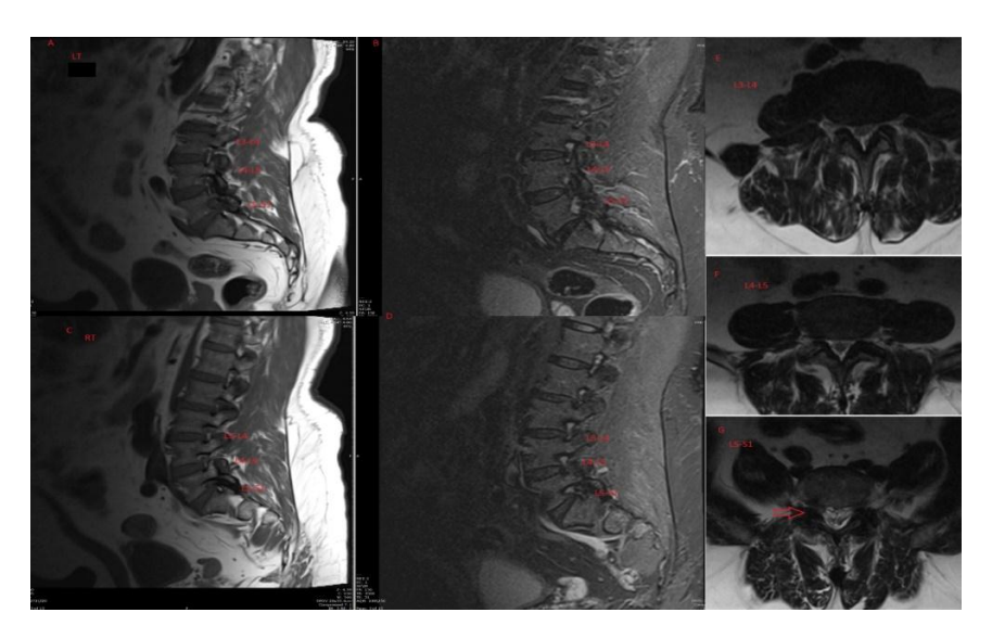
Fig 4. MRI lumbar spine showing narrowing central foramen on both sides (Images A, B, C, D) mainly right L5-S1 with trapped the nerve ganglia (Images D and G red arrow). Narrowing central canal (Images E, F, G)

This is a 69-year-old male patient with history of diabetes type 2 for 14 years, with BMI of 33.69kg/m², last glycemia control 6mmol/L, Hb A1% 6.2%, referring lumbar pain, cramps, numbness with weakness that increases after walking at least 200 meters, Lasegue maneuver positive on right side under 35 degrees. MRI was performed showing osteoarthritis of the lumbar spine, narrowing of the central canal, annular protrusion of disk from L1-L2 to L5-S1 contacting the dural pouch, facet joint hypertrophy from L1-L2 to L5-S1 contacting the dural pouch, and narrowing of the neural foramen from L1-L2 to L5-S1, mainly on the right side, L5-S1 with compressed neural ganglia. The nerve conduction had no significant findings; nevertheless, as per images, it is according to the clinical findings. The patient was referred to specialize hospital for surgery treatment. (Fig 4)